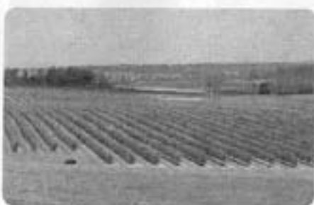
The olive grove in Queensland, Australia where the Fresh Olive Leaf Complex is produced. It's the largest in the world with over a half million trees.

with great success. However, the HALO Leaf of Life product, based on FOLC, needed to be tested.