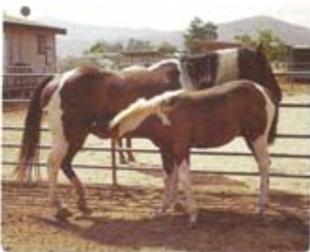
"Sandy," a paint broodmare at San Pasqual Valley Ranch.